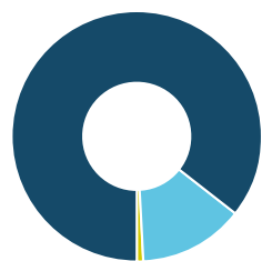
INCOME DISTRIBUTION 2016

THE EMMAUS COMMUNITY for many of us is like a second home. At Emmaus we support each other and respect our differences. We also aspire to hospitality: everyone is welcome, everybody is needed. We invite both donors and customers to solidarity voluntary work. In our fleamarkets items discarded by one become objects of value to another. People who feel left out can find a new meaning to their lives, and through the results of our combined efforts we can effect a more sustainable future. We thank all donors, our flea market customers, salaried and voluntary workers. Through this cooperation Emmaus Helsinki ry has been able to continue its work with ensured stability also in 2016.