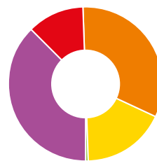
DISTRIBUTION OF COSTS 2016