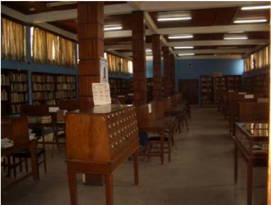
The reading-room of the George Padmore Library in Accra. - Photo MB, Febr 2006.

library. It is relishing to get away from the loud and big agglomeration that Accra has become. In these days, they are building so many new churches and mosques in Accra. I wish they would build new libraries instead!