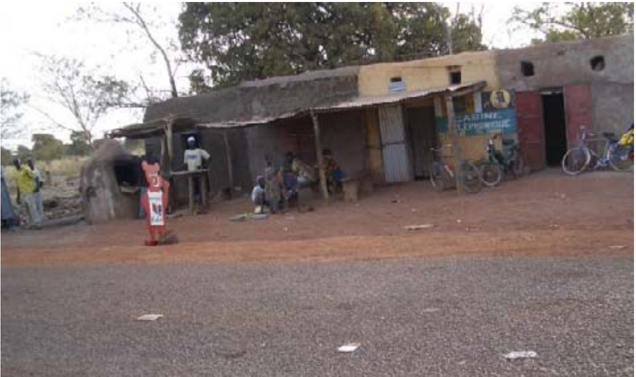
Phone booth. On the road between Bamako (Mali) and Bobo-Dioulasso (Burkina Faso).

Finished the library workshop in Mali, I stepped on the bus back to Accra (Ghana) via Ouagadougou (Burkina Faso). From Ghana, I was to return by air to Finland. During this journey I would gather some first hand information about the library situation in West Africa. Or so I thought.