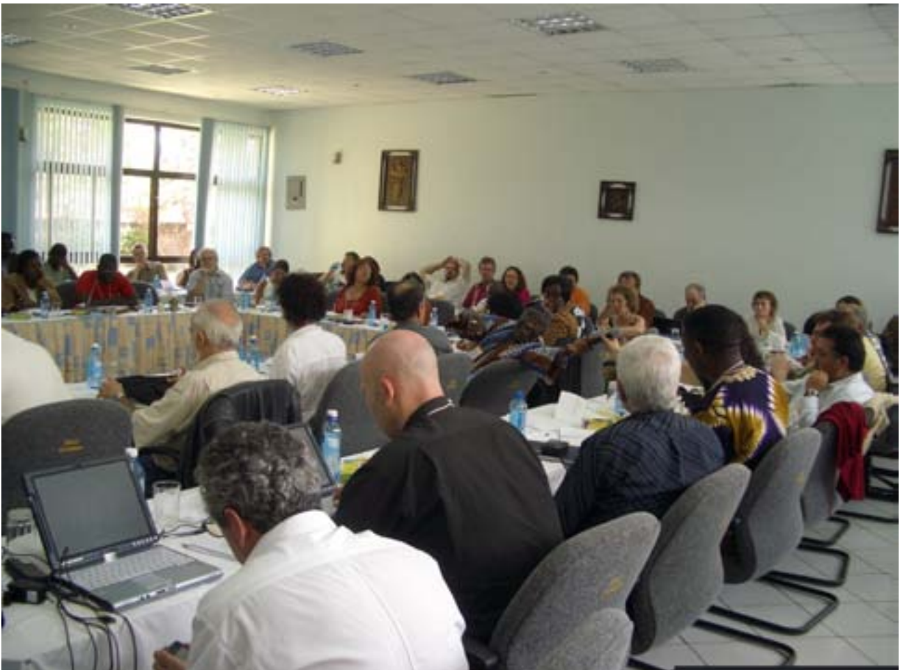
The WSF International Council Meeting in Nairobi, March 2006