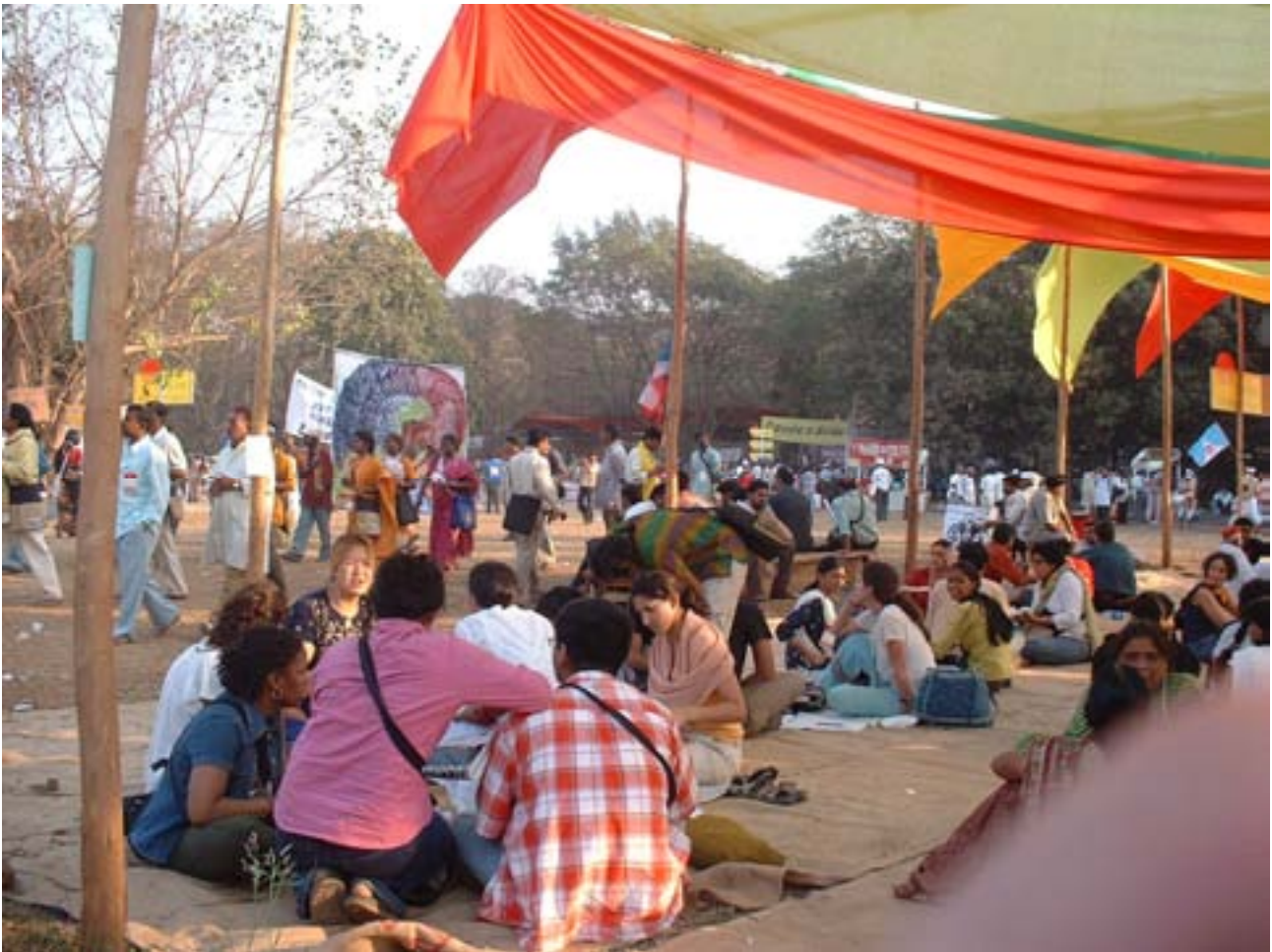
NESCO Grounds, the venue of World Social Forum in Mumbai, January 2004