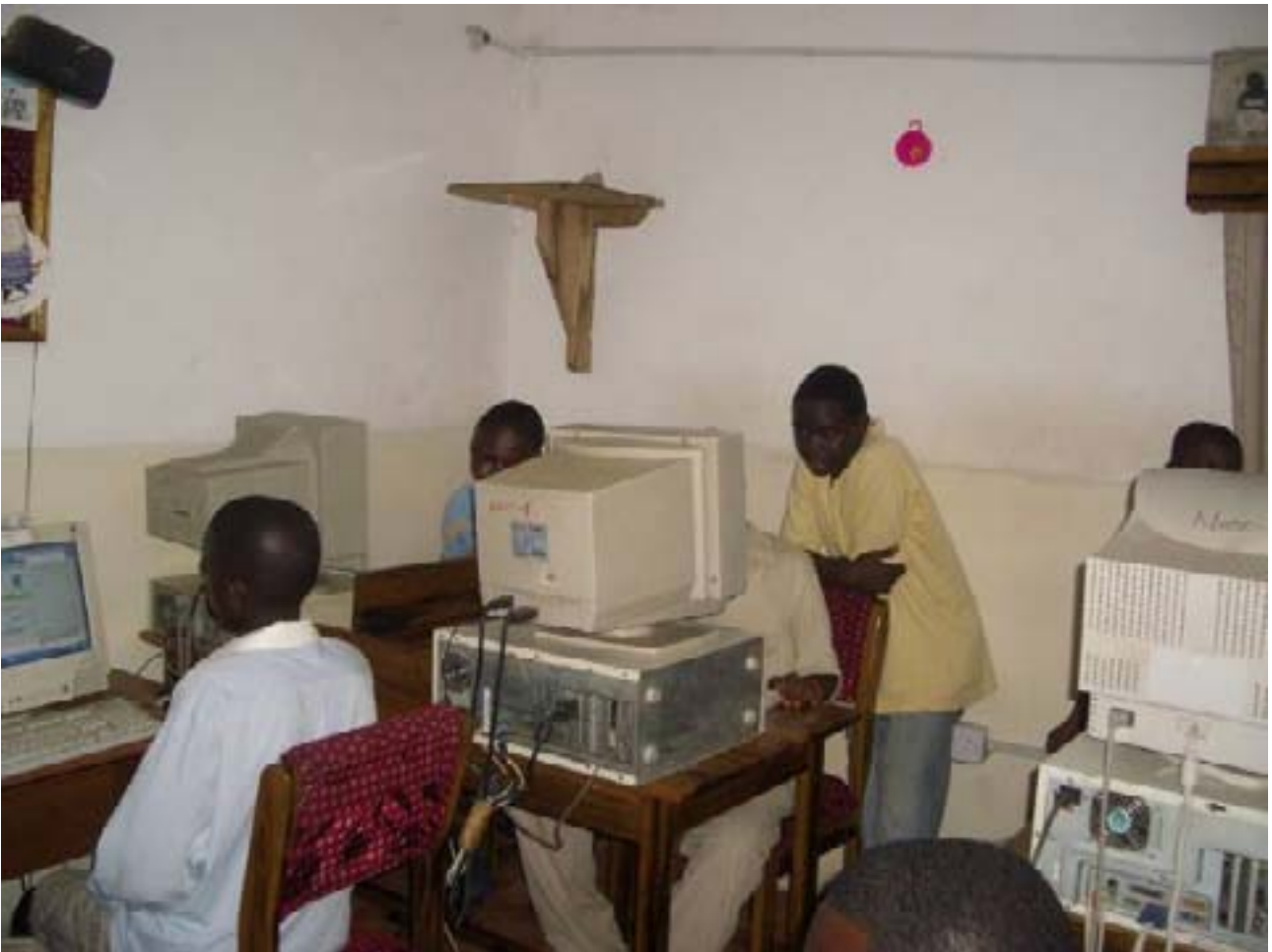
Illustration 1 An internet café in Accra (Ghana)