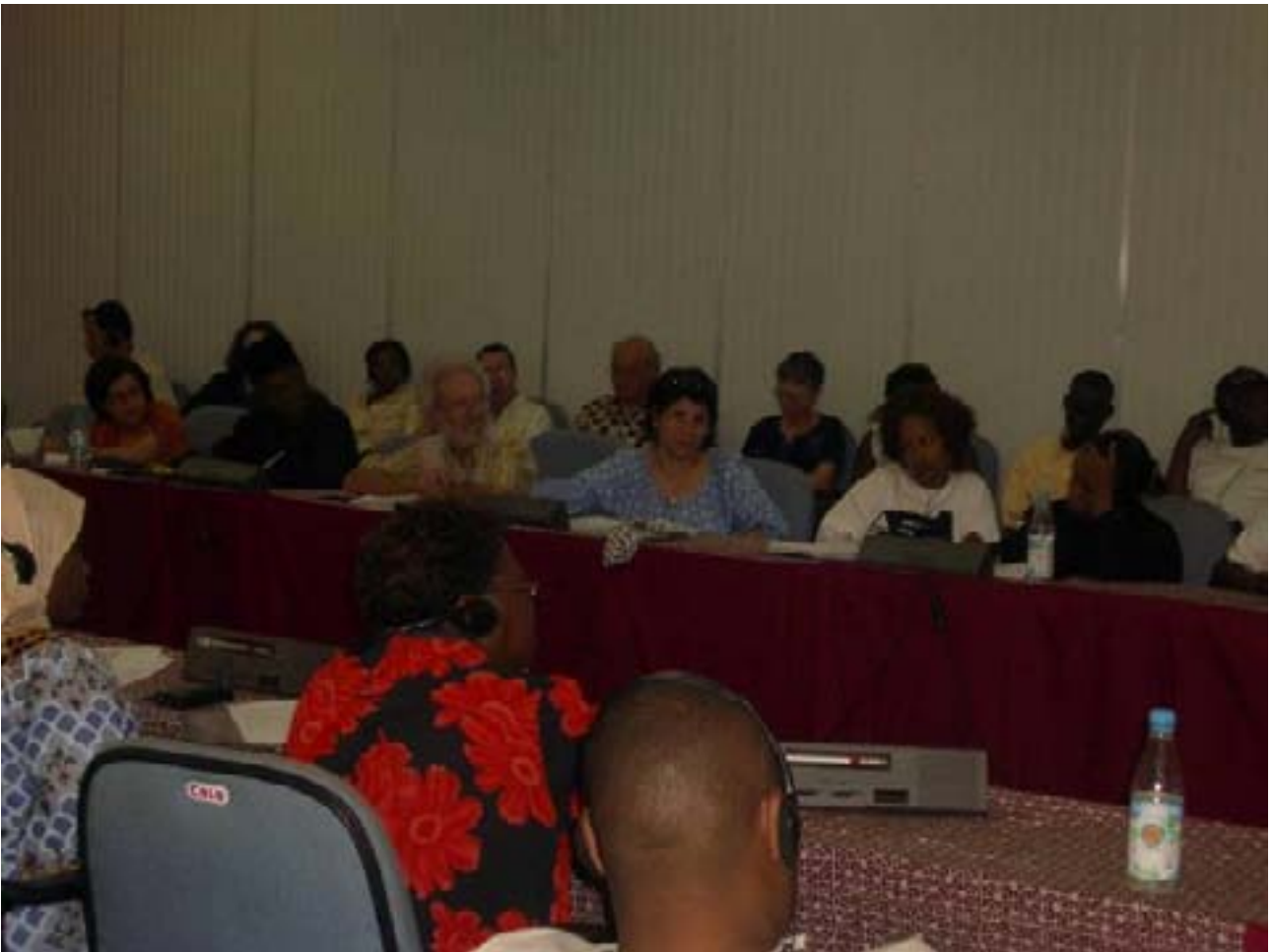
Illustration 2 Participants in the polycentric World Social Forum in Bamako (Mali), 18-24 January 2006, discuss world economy and politics.