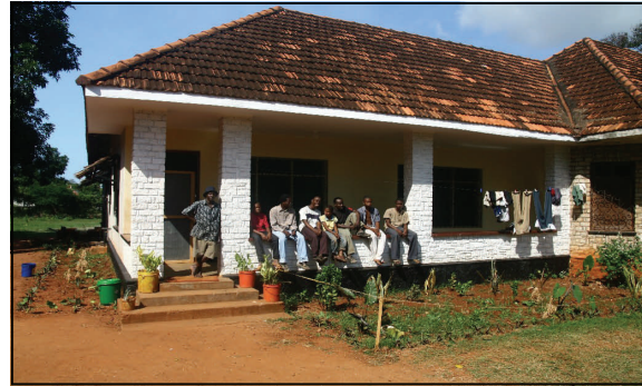
The Beach-House the boys recently moved into.

modates 15 orphan boys aged between 10 and 25 years. They are also being supported until they can fend for themselves.