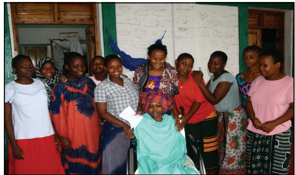
After many setbacks the children can enjoy their new lives in the orphanage.