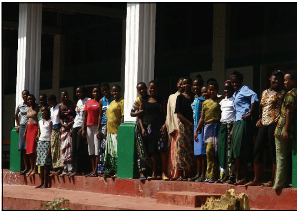
The girls are given a chance to lead their own independent lives.

modates 15 orphan boys aged between 10 and 25 years. They are also being supported until they can fend for themselves.