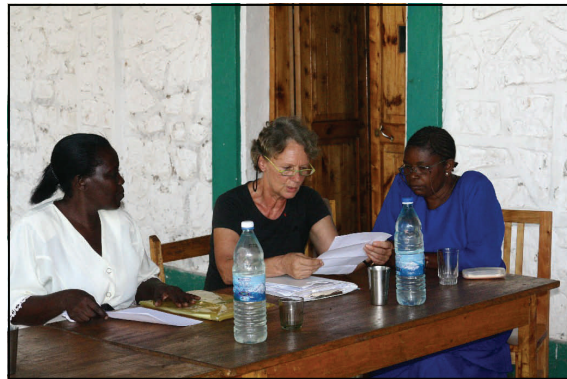
Once a week the founders of Pamoja have a meeting in which they discuss the needs of the orphans.